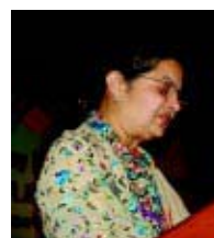
Ms Rajashree Birla, Chairperson, Aditya Birla Group, India