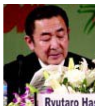
Late Dr Ryutaro Hashimoto, former Prime Minister of Japan