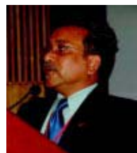
Mr Hamdun Abdulla Hameed, Minister of Planning and National Development, Maldives

Visit our website < www.teriin.org/dsds >