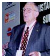
Nobel Laureate Prof. F Sherwood Rowland, Donald Bren Research Professor, University of California, Irvine