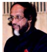
Dr R K Pachauri, Director-General, TERI