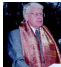
Dr Olafur Ragnar Grimsson, President of the Republic of Iceland