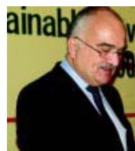
HRH Prince El Hassan bin Talal, Prince of Jordan