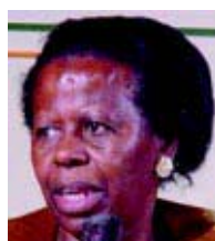
Ms Rejoice Mabudafasi, Hon'ble Deputy Minister for Environmental Affairs, South Africa