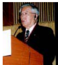
Dr Shoichiro Toyoda, Honorary Chairman, Toyota Motor Corporation, Japan