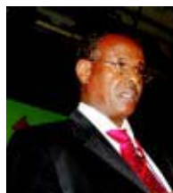
Mr Adugna Jebessa, State Minister of Water Resources, Ethiopia