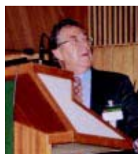
Nobel Laureate Prof. Paul Crutzen, Dept of Atmospheric Chemistry, Mainz, Germany