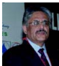
Mr Y C Deveshwar, Chairman, ITC Ltd, India