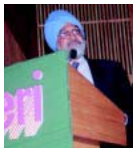
Dr Montek Singh Ahluwalia, Dy Chairman, Planning Commission, India