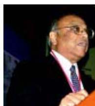
Prof. C K Prahalad, University of Michigan, USA