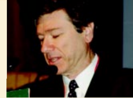
Pro. Jeffrey D Sachs, Director, The Earth Institute and Special Advisor to the Secretary-General of the United Nations, USA