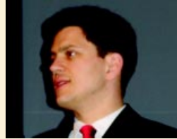
Mr David Miliband, former Secretary of State for Environment, Food and Rural Affairs, Government of UK