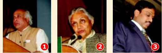
1 Mr Jairam Ramesh, Hon'ble Minister of State, Ministry of Commerce and Industry, Government of India 2 Smt. Sheila Dikshit, Hon'ble Chief Minister of Delhi, India 3 Mr A Raja, former Hon'ble Minister for Environment and Forests, Ministry of Environment and Forests, Government of India