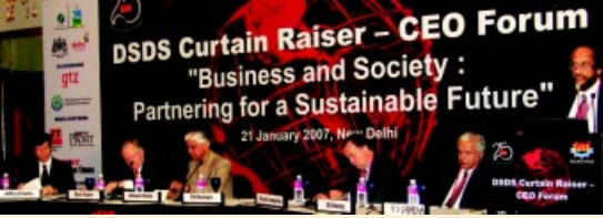
Discussions at the CEO Forum