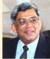
Mr Deepak S Parekh, Chairman, Housing Development Finance Corporation Ltd, India